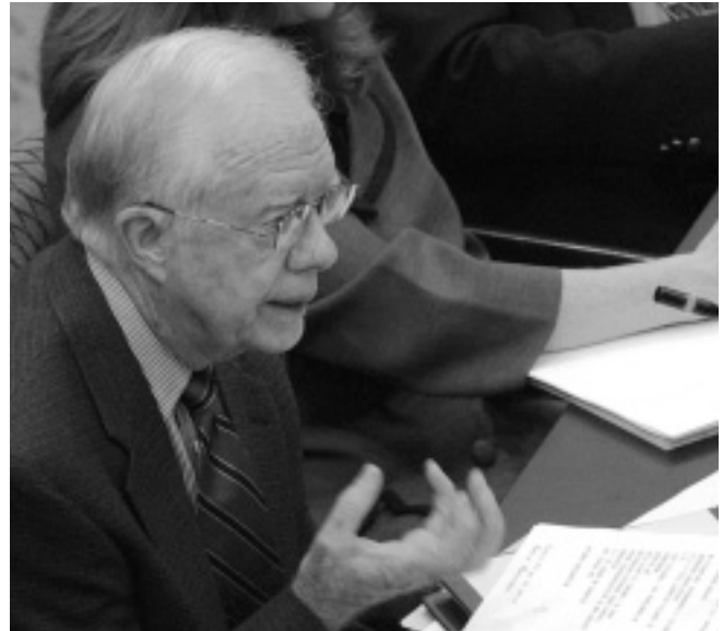
Former President Jimmy Carter makes a critical point at the Center’s conference.

Activists say some governments are using those laws to crack down on dissidents and human rights defenders.