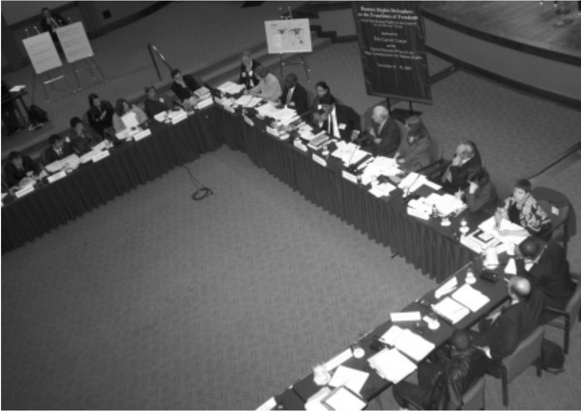
The conference allowed for two full days of intense discussion among defenders from around the world about balancing the need for global security with protection for fundamental rights.

increase in the resources allocated to the United Nations' human rights system.