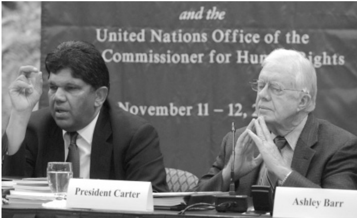
President Carter and Bertrand Ramcharan co-chaired the Human Rights Defenders conference.

Many of them have either spent time in prison or been the subject of harassment as a result of their work in holding their governments accountable to international standards of human rights and the