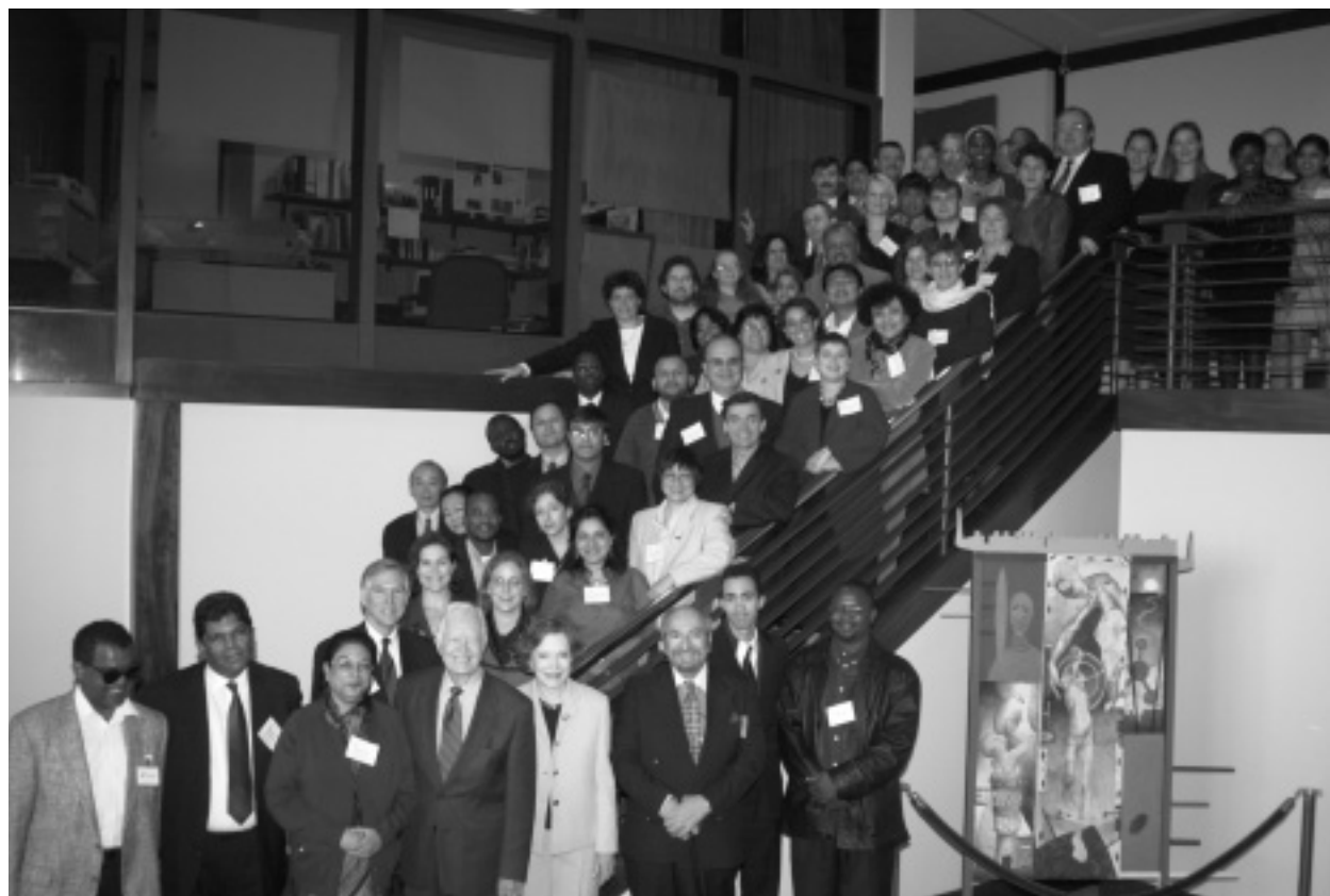
Human rights defenders from around the world joined President and Mrs. Carter and U.N. human rights leaders at The Carter Center, Nov. 11-12, 2003.