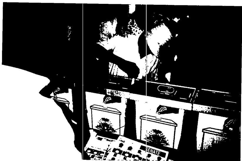
Balloting commences in Port-au-Prince, December 1990.