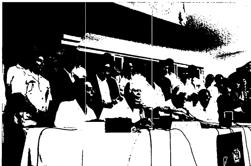
Observer delegation holds post-election press conference, December 17, 1990. Seated (l to r) are delegation co-leaders: George Price, Jimmy Carter and John Whitehead.