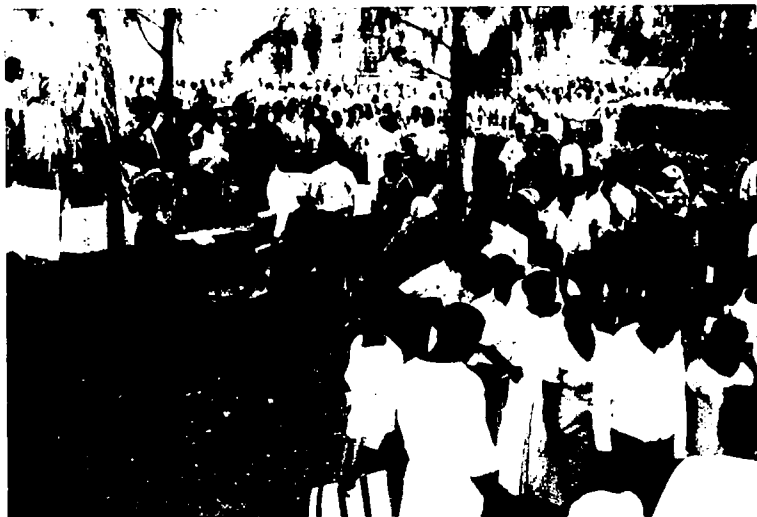
Haitian citizens wait in line to vote in Carrefour, December 1990.