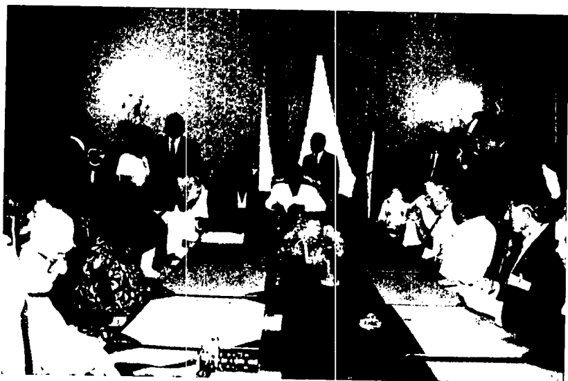
Delegation meets with President Ertha Pascal Trouillot prior to elections, December 1990.