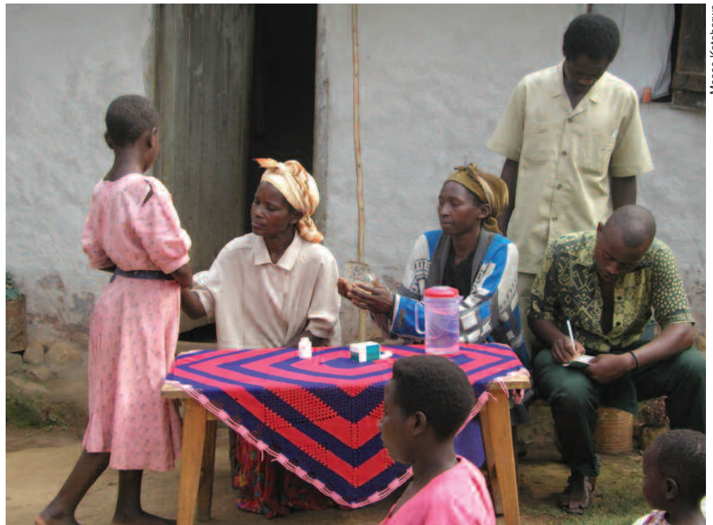
Community health workers distribute Mectizan in Uganda.

Children under 5 years old are too young to receive the drug Mectizan, which treats river blindness, but in Cameroon, these children now receive a different health boost at the same time their parents are being treated with Mectizan—vitamin A. Vitamin A boosts overall immunity to other diseases, so children are less susceptible to infections such as measles, malaria, and diarrheal diseases. It also reduces the risk of childhood blindness. In Cameroon, vitamin A capsules were administered during national immunization days for polio. Now that polio vaccinations are drawing to a close as polio eradication approaches, Cameroon's river blindness program offers an alternative channel for delivering the nutrient. To date, 230,049 children between the ages of 1 and 5 years have received the supplement.