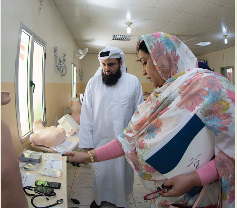
In Sudan, health training equipment was distributed in December for use by medical educators. The training aids will help strengthen the teaching environment for Sudan's science institutions and were presented in a ceremony at the Omdurman Midwifery Training Center.

The initiative aims to strengthen the health care teaching environment in Sudan,