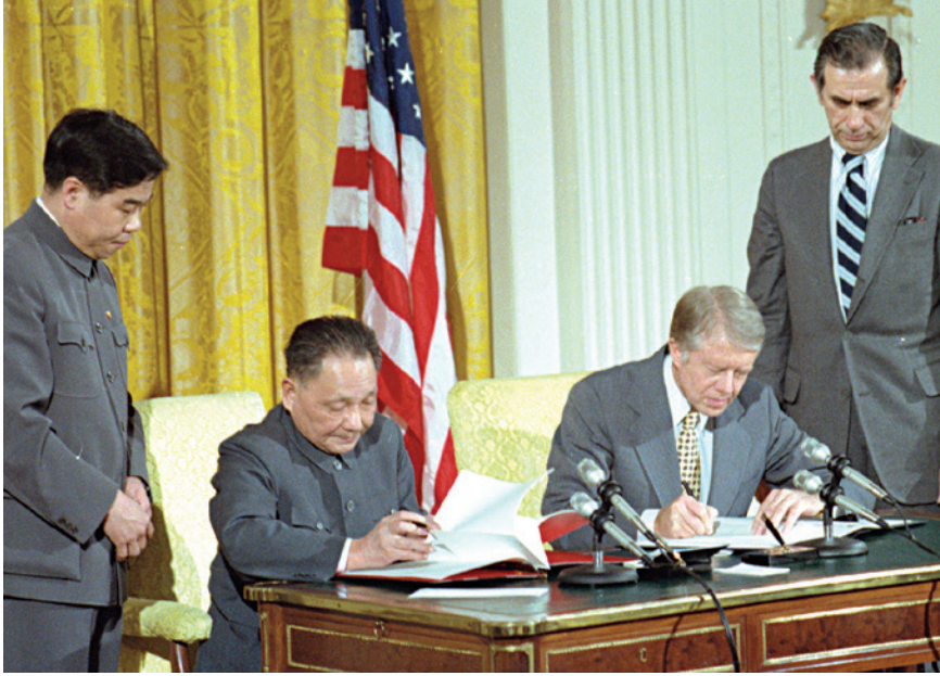
On Jan. 31, 1979, Vice Chairman Deng Xiaoping and President Jimmy Carter sign diplomatic agreements between the United States and China.