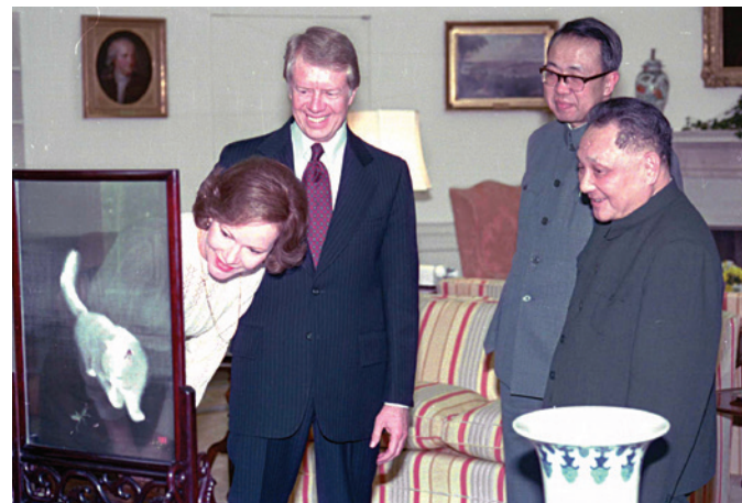
President and Mrs. Carter view a gift of double-sided embroidery from Deng Xiaoping during a state visit at the White House in January 1979 following the announcement of the normalization of relations with China.

I would remind people who make such claims that when we normalized relations, we knew that the U.S. and China had vastly different cultures, histories, forms of government, interests, and levels of development. We acknowledged these differences and anticipated that differences between our two countries would persist. But we also believed that the goals that bound us together—mutual respect, the pursuit of peace, prosperity, and progress—were much