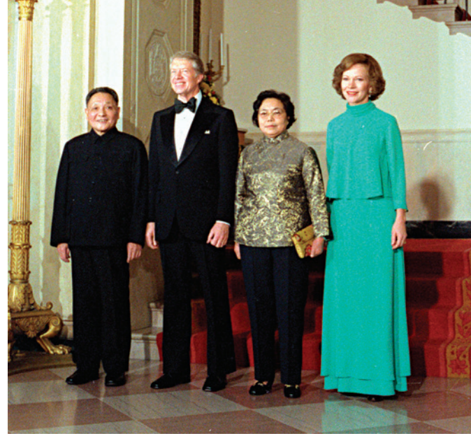
Deng Xiaoping, Jimmy Carter, Madame Zhuo Lin, and Rosalynn Carter pause before attending a state dinner for the vice chairman of China in January 1979.

emerged as the paramount leader of China. For him, normalization was as important a goal as it was for me. We announced our agreement simultaneously in Beijing and Washington, on Dec. 15 and 16, 1978.