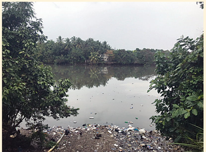
In the Dominican Republic, the slow-moving, polluted Río Haina west of Santo Domingo provides a ripe environment for the mosquitoes that spread malaria.