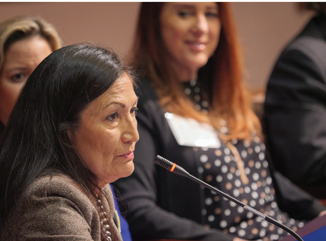
Deb Haaland, one of the first two Native American women elected to the U.S. Congress, addresses a Carter Center conference last December on impediments to Native American voting.