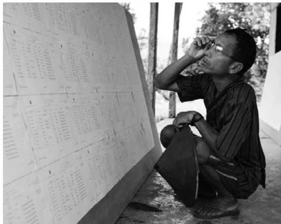
A voter from Kayin state checks his name on the voter list.

serving prison sentences regardless of the severity of the crime, should be reconsidered as they are inconsistent with the principle of universal and equal suffrage “without unreasonable restrictions” enshrined in Article 25 of the ICCPR. 41