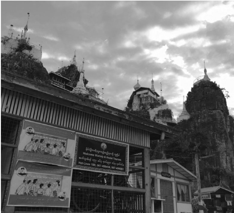
Posters in Loikaw, Kayah state, remind voters to check the accuracy of the voter list.

are not directly elected in the upper House of Parliament is a practice in some countries, the appointment of members to the lower House is inconsistent with international democratic norms, which specify that the will of the people as expressed in genuine elections is the basis for government authority. 17