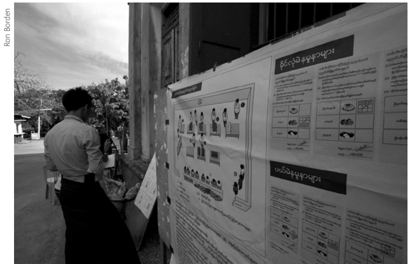
Posters showing voting procedure are displayed outside a polling station in Yangon.

In conclusion, it is clear that there has been a substantial improvement in the breadth and quality of political space in Myanmar in recent years, allowing for a vibrant and relatively unrestricted campaign period. For the most part, the authorities exercised their discretion in a reasonable way, consistent with international good practice. However, the legal framework in Myanmar does not adequately protect freedom of expression and association and should be reformed. Harassment of journalists and human rights defenders must also end for the political environment to conform with the requirements of international human rights standards. Racially and religiously provocative language remained a problem, and there was a lack of transparency in decision making around election cancellations.