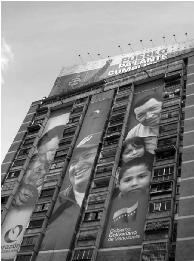
Chávez propaganda was displayed on a housing complex in Caracas.

interprets the content of the cadenas as falling into a gray area regarding what exactly constitutes electoral propaganda. 40