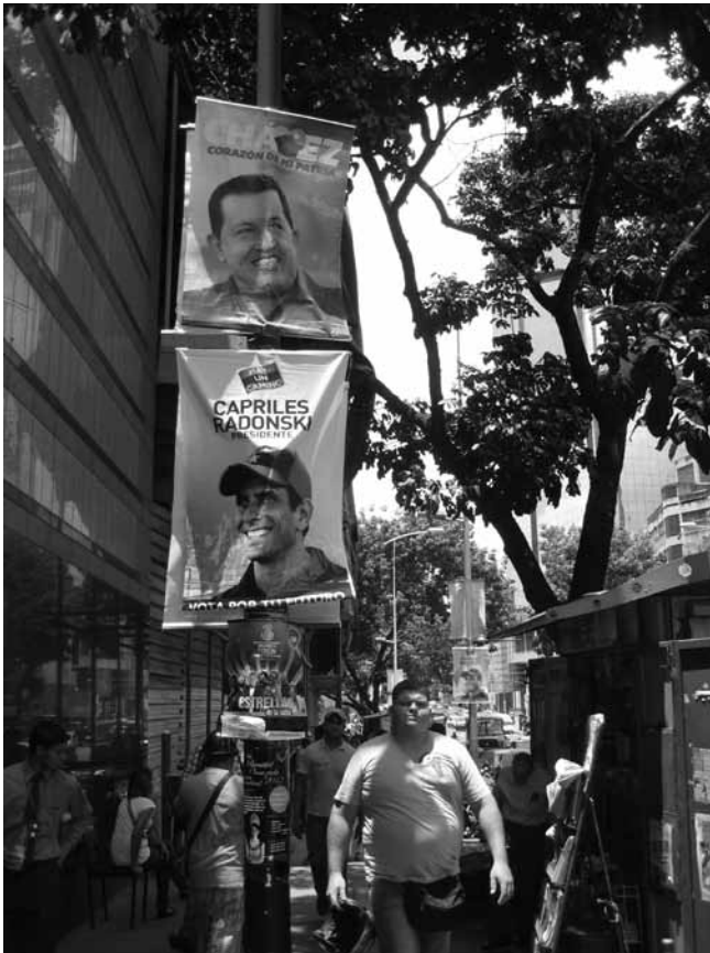
Campaign propaganda in the streets of Caracas supported Capriles.

leadership, and “Guidelines for a Governing Program of National Unity,” agreed to in December by five of the six opposition presidential candidates. 13