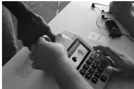
A voter tests the fingerprint identification system during an Aug. 5 election simulation in Venezuela.

Prior to the elections, the database was nearly complete, except for 7 percent of registered voters not entered or with poor quality prints. These voters could enter their fingerprints on election day. (The MUD reported that it was satisfied with the data collection process.) This year the system was modified to add one remote session activator (RSA) to